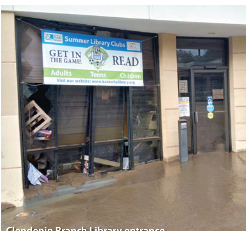
Clendenin Branch Library entrance