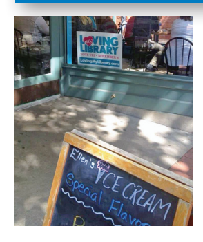
Supporters put more than 3,000 yard signs in their yards, cars and businesses.