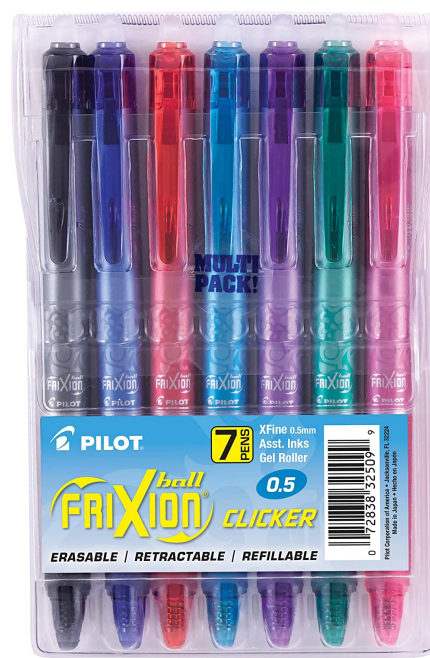
Erasable Pen Set