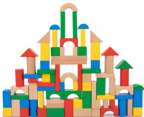
Wood Block Set