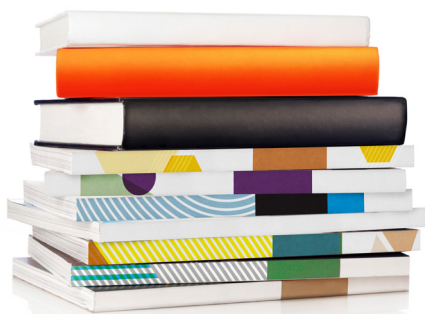
Chapter Book Set