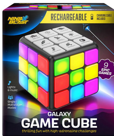
Rechargeable Game Activity Cube